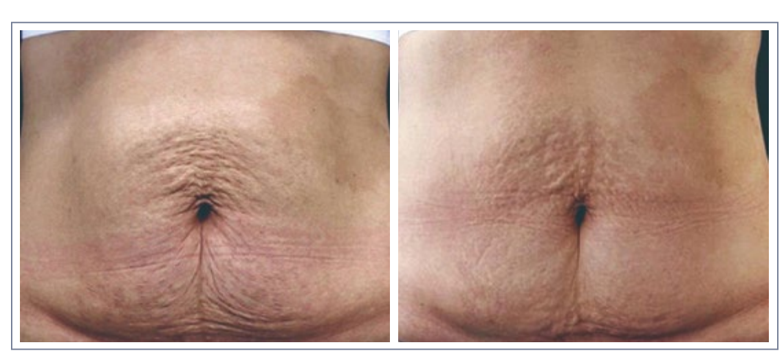
Skin laxity of the abdomen before and after treatment with ProLift RFM

the RFM," he explained. "We may even add the IPL using the 585 nm filter to address posttreatment erythema."