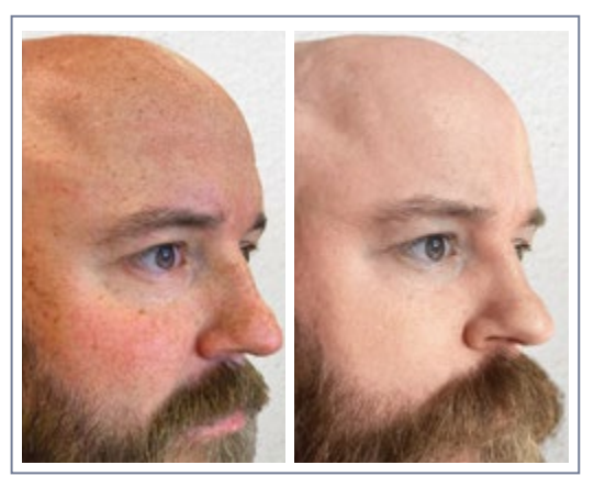
Redness and pigmentation before and after a course of treatments with Lucent IPL